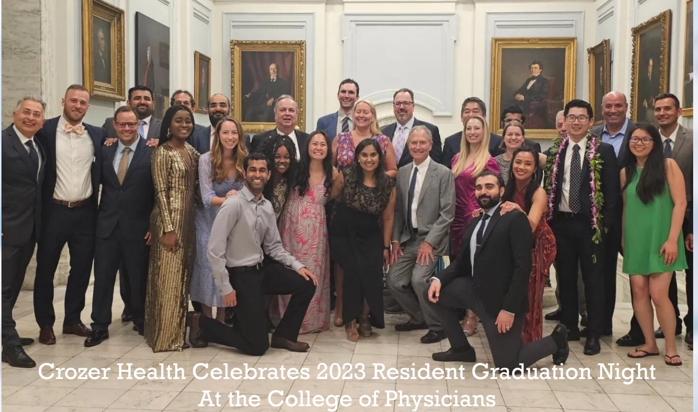
Crozer Health Celebrates 2023 Resident Graduation Night At the College of Physicians