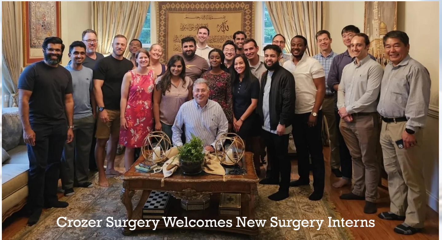
Crozer Surgery Welcomes New Surgery Interns